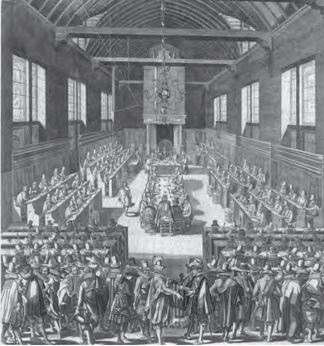
The Synod of Dort (1618–1619)

to his many-faceted gifts and interests. He was a godly Christian with a heart that was sensitive to the needs of the poor, a great exegete and biblical scholar, a well-known and able Reformed preacher who stressed the practice of piety ( praxis pietatis ), a faithful and beloved shepherd of souls, a gifted historical theologian, an influential writer in the mainstream of the Dutch Further Reformation, and a capable guide in church affairs in Zeeland. He enjoyed great respect at classes and synods, and became particularly well known after his important role as vice president of the Synod of Dort. He was a great help for the Dutch Reformed Church in battling Arminianism before, during, and after the Remonstrant controversy.