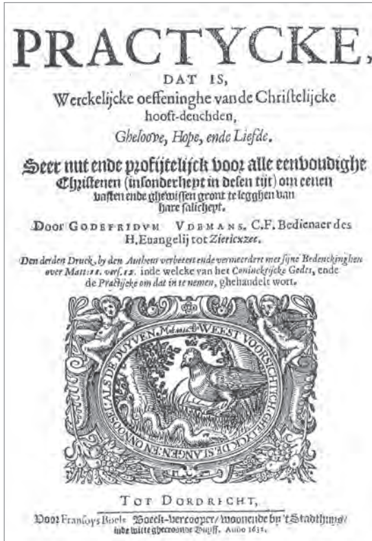
Dutch Title Page