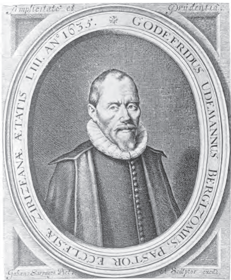
Godefridus Cornelis Udemans (c. 1581–1649)