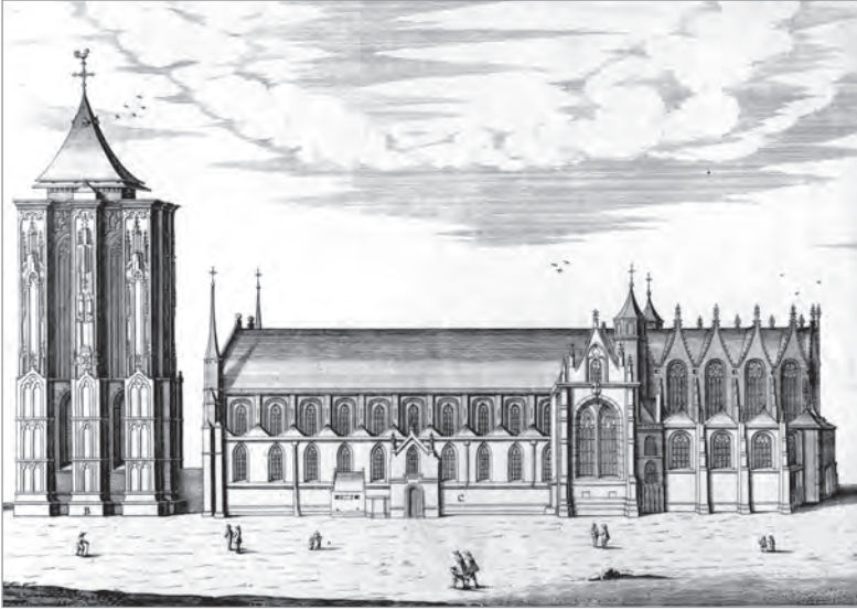
St. Lievensmonster tower and church in Zierikzee (1657)

through a pure conscience, a sanctified will, and sanctified affections. It also means having a renewed tongue and being renewed in our visible conduct. And it means constantly strengthening all of these marks and graces by using the spiritual armor Paul speaks of in Ephesians 6:10–20, and through watchfulness and prayer, humility and meekness, and simplicity and caution.