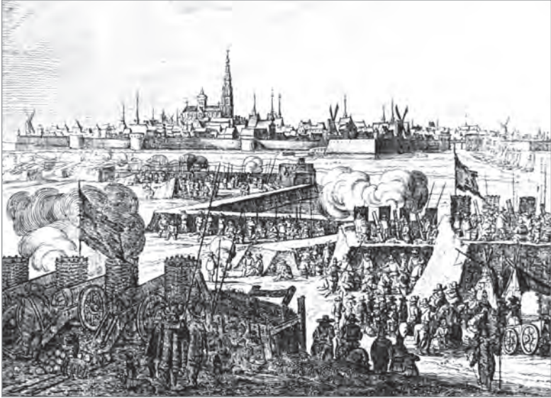
's-Hertogenbosch and its surroundings, where Udemans frequently served