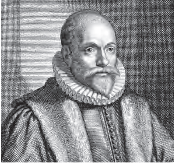
James Arminius, professor at Leiden whose theology was embraced by the Remonstrants