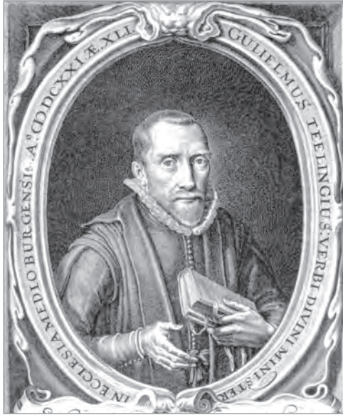
Willem Teellinck, father of the Dutch Further Reformation and contemporary of Udemans

In most of these books, Udemans strongly opposed nominal Christians who spoke freely about Christ's grace but whose lives showed no fruits of having been born again. Most of all, however, Udemans delighted to comfort God's people and promote their sanctification. He focused with precision on the practice of piety ( praxis pietatis ) in both its practical and experiential dimensions. Inner piety as evidenced through various cases of conscience, as well as inward spiritual joyfulness, receives a good portion of his attention. It is no coincidence that the only book of the Bible on which he wrote in full was the Song of Solomon. Like other Dutch Further Reformation divines, he grapples with questions related to assurance of faith, such as the internal evidences of the Holy Spirit, the practical syllogism, and the marks of saving grace. Yet, even as he deals with such matters, Udemans does not lose an objective-subjective balance. Justification and sanctification continue to function harmoniously in his theology, much like in John Calvin's.