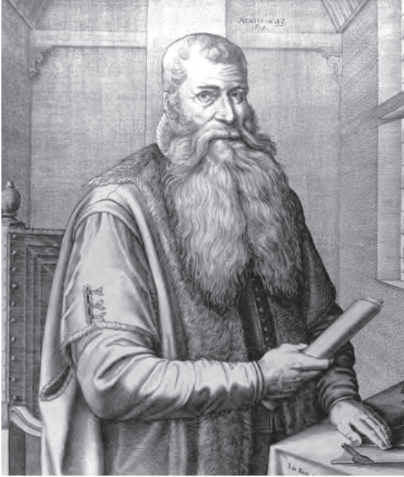
Johannes Bogerman, chairman of the Synod of Dort