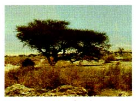
Acacia tree growing in the Sinai desert.

the tabernacle (RSV: Deut. 10:3; Ex. 25-27; 30; 37-38). Same as shittim wood from the shittah tree (KJV).