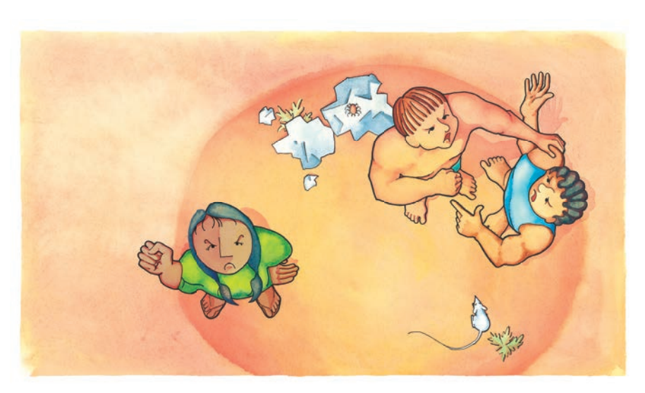
People Fill the Earth with Violence and Evil GENESIS 6:5-13

<sup>5</sup> The LORD saw that the wickedness of man was great in the earth, and that every intention of the thoughts of his heart was only evil continually. <sup>6</sup> And the LORD regretted that he had made man on the earth, and it grieved him to his heart. <sup>7</sup> So the LORD said, "I will blot out man whom I have created from the face of the land, man and animals and creeping things and birds of the heavens, for I am sorry that I have made them." <sup>8</sup> But Noah found favor in the eves of the LORD.