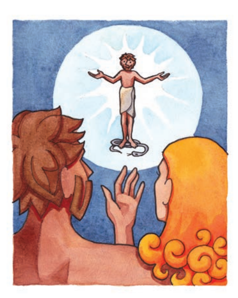
God Promises a Savior GENESIS 3:15

He said to the woman, "Did God actually say, 'You shall not eat of any tree in the garden'?" <sup>2</sup> And the woman said to the serpent, "We may eat of the fruit of the trees in the garden, <sup>3</sup> but God said, 'You shall not eat of the fruit of the tree that is in the midst of the garden, neither shall you touch it, lest you die.'" <sup>4</sup> But the serpent said to the woman, "You will not surely die. <sup>5</sup> For God knows that when you eat of it your eyes will be opened, and you will be like God, knowing good and evil." <sup>6</sup> So when the woman saw that the tree was good for food, and that it was a delight to the