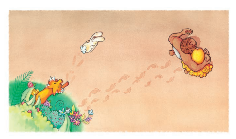
God Sends Adam and Eve Out from the Garden of Eden GENESIS 3:22-24