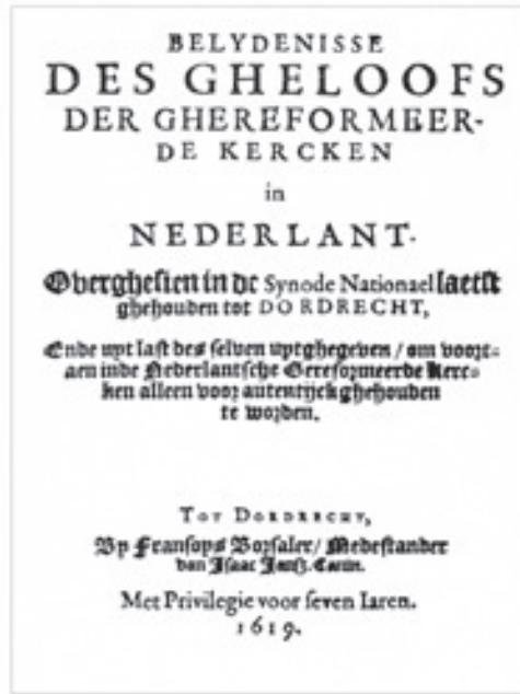
Edition of the Belgic Confession of Faith, adopted as a confessional statement by the Synod of Dort

Faith and the Catechism. The Geneva Catechism eventually made way for the Heidelberg Catechism, in part because the Walloon churches followed the French churches in adopting their Confession of Faith along with Calvin's catechism. The Catechism of the Palatinate and the Belgic Confession of Faith remained the chief confessional statements of the churches of the Netherlands. Despite the essential similarity of these two confessional statements, there are also striking differences. There is, first of all, the role played by the immediate context. Even though the Heidelberg Catechism soon encountered resistance from Lutheran theologians, it was born in a situation of relative peace. In contrast, the Belgic Confession of Faith (1561) emerged in a painful struggle for freedom and independence from an enemy that sought to suppress the church by fire and sword. The fallout from this experience can be recognized in the language of this confessional statement. Guido de Brès, who composed this document, was a martyr. Its final article shows traces of oppression and persecution. Similarly, the articles on the true and false church betray a position of tremendous pressure.