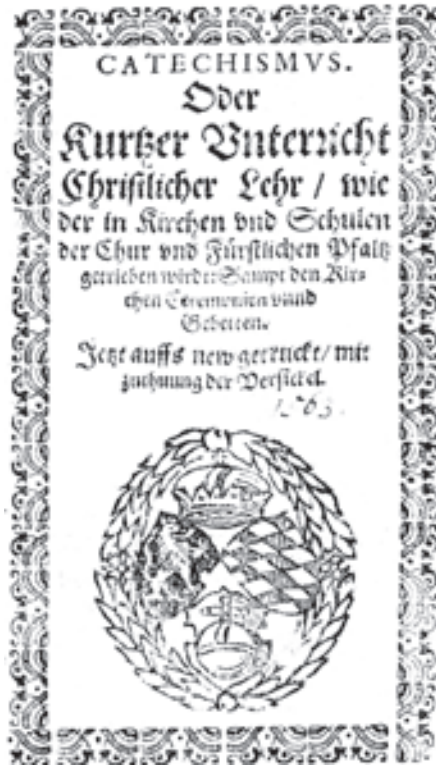
The second edition of the Heidelberg Catechism (February 1563), in which question 80 was incorporated

not limited to His assumed, human nature. Although it remains completely united with His human nature, it is not limited to it. It is also present beyond this humanity. This “additional” presence of Christ or presence beyond His humanity has been interpreted as a typically Calvinistic idiosyncrasy. It could open the door to speculations concerning God’s revelation or the operation of the Divine Logos outside Christ. As a rule, we do not encounter such speculation on the part of Calvin or the Reformed community. This digression of the Catechism reflects the far-reaching set of issues associated with the conflict surrounding the Lord’s Supper. Whether Christ’s church can still benefit from these ideas today remains an open question.